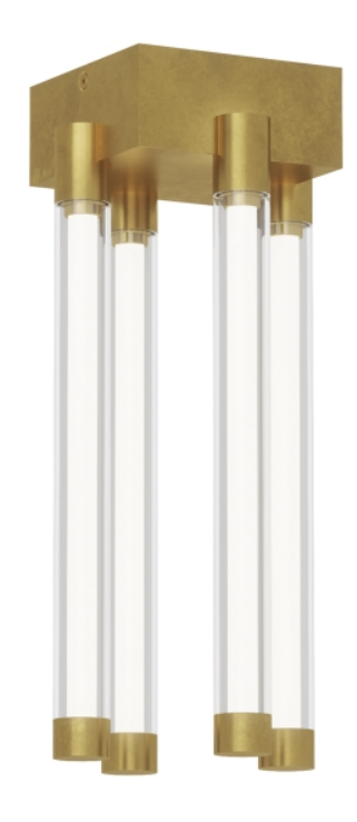
Natural Brass (Lit)