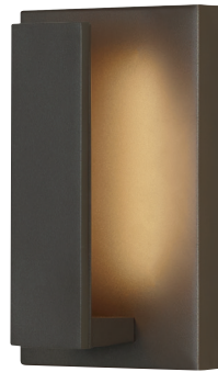
NATE 09 shown in bronze