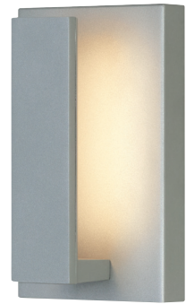
NATE 09 shown in silver