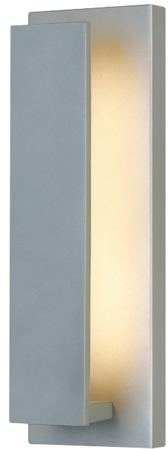
NATE 17 shown in silver