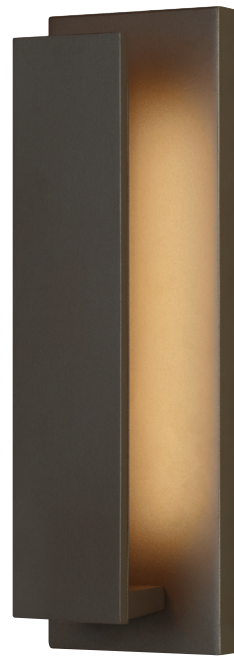
NATE 17 shown in bronze