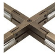
MonoRail X Connector