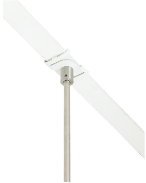
MonoRail T-Bar Connector

The T-bar clip twists into the slat. (Use only if local electrical codes allow). Specify 15/16" or 9/16" slat.