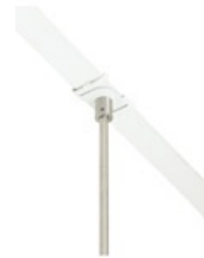
MonoRail T-Bar Connector