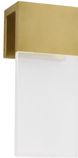
Natural Bras Alt (Lit)