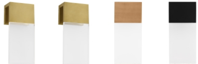
Natural Bras Alt (Lit)