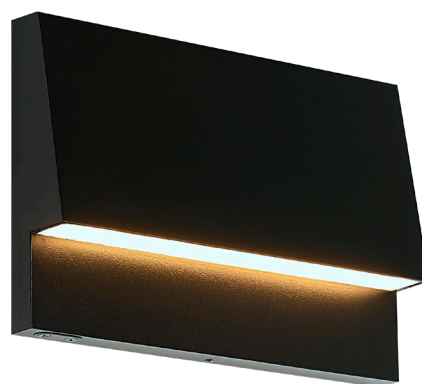
KRYSEN OUTDOOR WALL/STEP LIGHT shown in black

* Visit techlighting.com for specific warranty limitations and details.