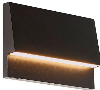
KRYSEN OUTDOOR WALL/STEP LIGHT shown in bronze