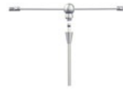
Kable Lite FreeJack Connector