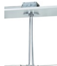
Kable Lite 4" Round Power Feed Canopy Dual-Feed