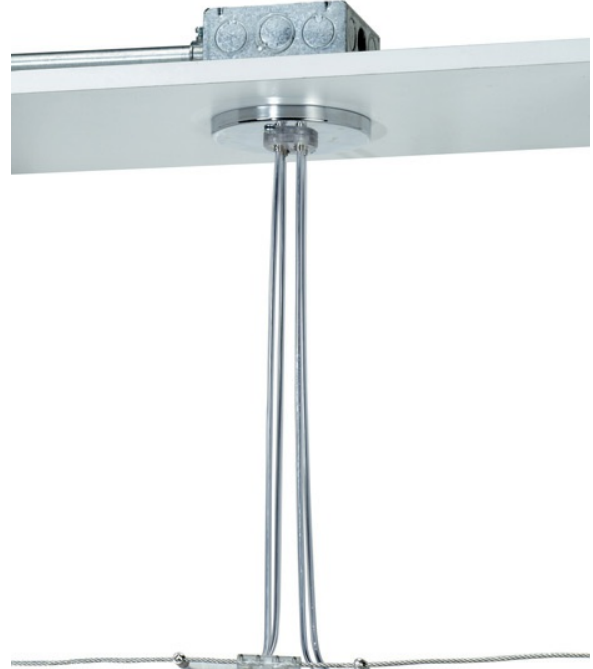
Kable Lite 4" Round Power Feed Canopy Dual-Feed

It can be used anywhere in the run. It brings power to the Kable Lite run from a remote dual-feed transformer (sold separately). The low-voltage leads from the remote transformer are connected to the canopy leads inside a standard 4" junction box. The four leads from the canopy are 24" long and can be cut and bent in the field. To drop the Kable Lite system farther down from the ceiling, add two pair of hardwire feeds (sold separately). Isolating connectors for bare cable are included to isolate power feeds from each other.