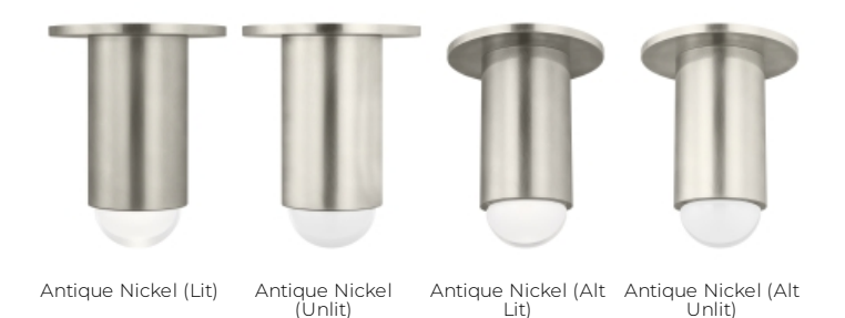
To view all available finish options, please visit techlighting.com