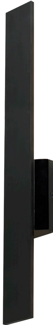
BLADE 24 OUTDOOR WALL shown in black

* Visit techlighting.com for specific warranty limitations and details.