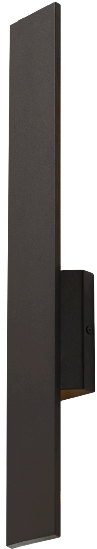
BLADE 24 OUTDOOR WALL shown in bronze