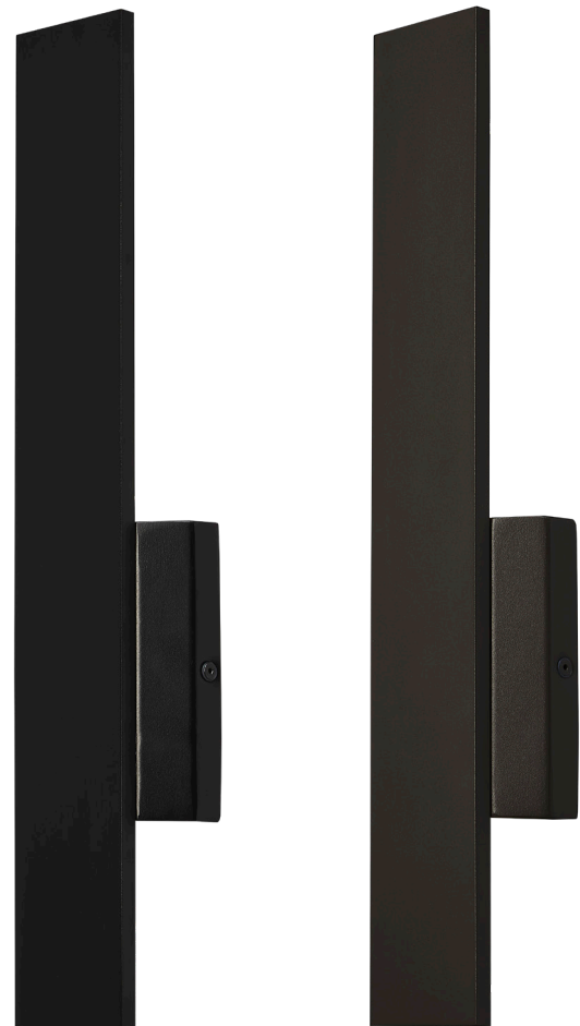
BLADE 18 OUTDOOR WALL shown in black

* Visit techlighting.com for specific warranty limitations and details.