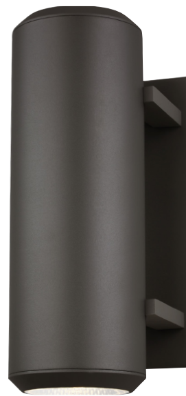
ASPENTI 14 shown in bronze

* Visit techlighting.com for specific warranty limitations and details.