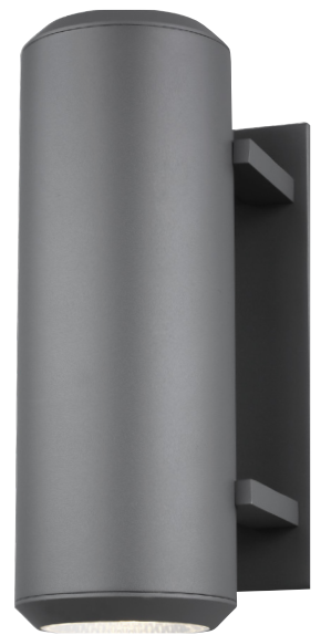
ASPENTI 14 shown in charcoal