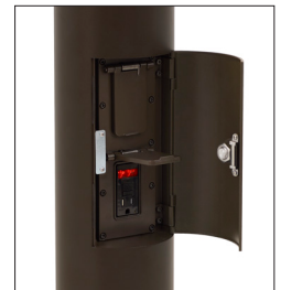
Shown with optional GFCI outlets