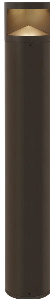
ARKAY 1 BOLLARD shown in bronze