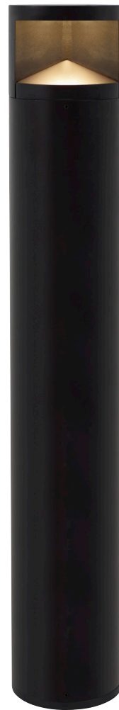
ARKAY 1 BOLLARD shown in black