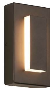
ASPEN 8 shown in bronze