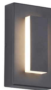
ASPEN 8 shown in charcoal

* Visit techlighting.com for specific warranty limitations and details.