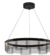
Smoke / Black 30"