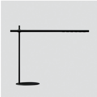
matt black w / red textile cord