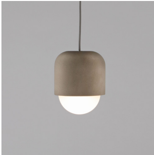
concrete gray + matt opal