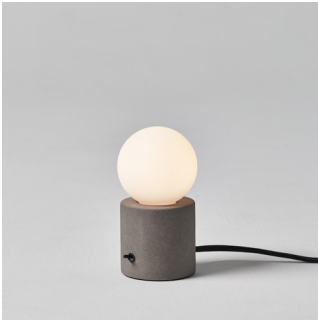
concrete gray + matt opal