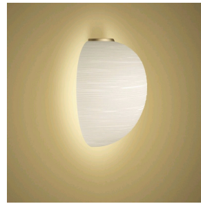
Rituals XL Mix&Match