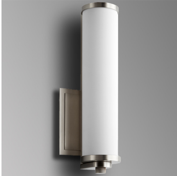
-24 Satin Nickel