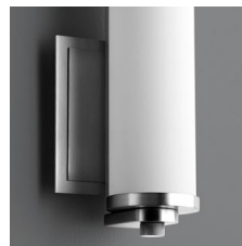
-20 Polished Nickel