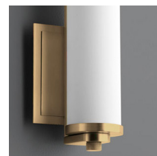
-40 Aged Brass