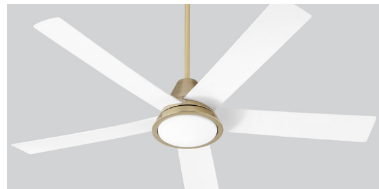
-640 White/Aged Brass/White ABS Blades

SPECIFICATIONS 3 ABS Blades / 56" Blade Sweep / 13° Blade-Pitch 125mm DC Motor 4" and 6" downrod (Included) Optional downrods available for high ceilings 6 Speeds - Reversible with wall control 0.37A on high / 0.04A on low 26W on high / 2W on low 150 rpm on high / 50 rpm on low Wall Control (Included)