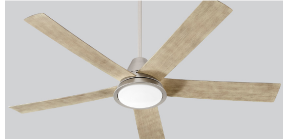
-24 Satin Nickel/Weathered Gray ABS Blades