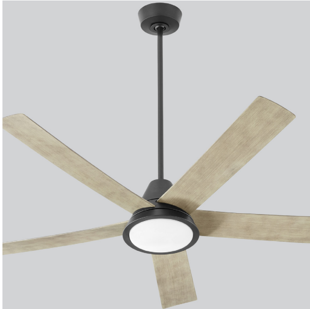
-15 Black/Weathered Gray ABS Blades