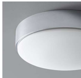
-14 Polished Chrome