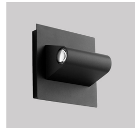
-Alternate Mounting Option