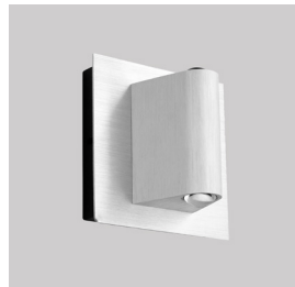
-16 Brushed Aluminum