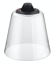
F0260000A Noctambule Cone