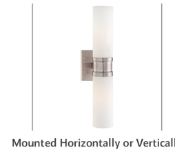
Mounted Horizontally or Vertically