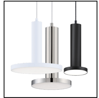
57600 PENDANT ACCESSORY (Sold Separately, Fixture NOT included)

Job Name : _____ Job Type : _____ Quantity : _____ Comments : _____