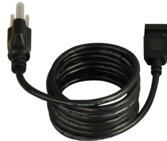
87880 BK, WT MXInterLink4 Connector Cord 72" 72"L x 1"W x 0.5"H