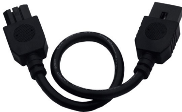
9" 87876 BK, WT 18" 87877 BK, WT 24" 87878 BK, WT MXInterLink4 Connector Cord