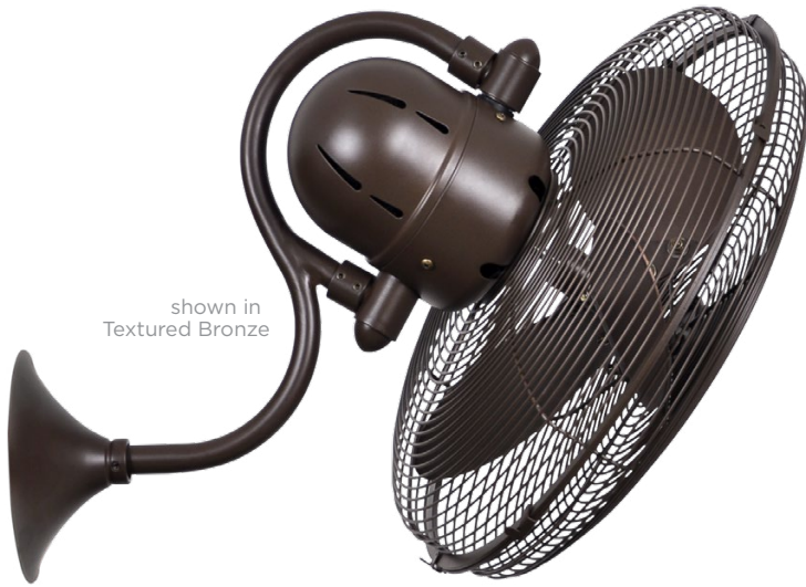
shown in Textured Bronze