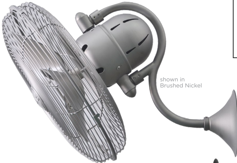
shown in Brushed Nickel