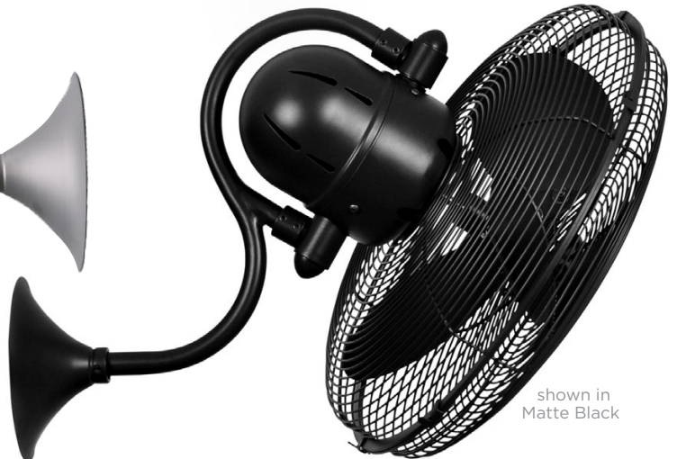
shown in Matte Black