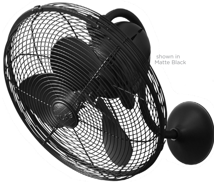
shown in Matte Black