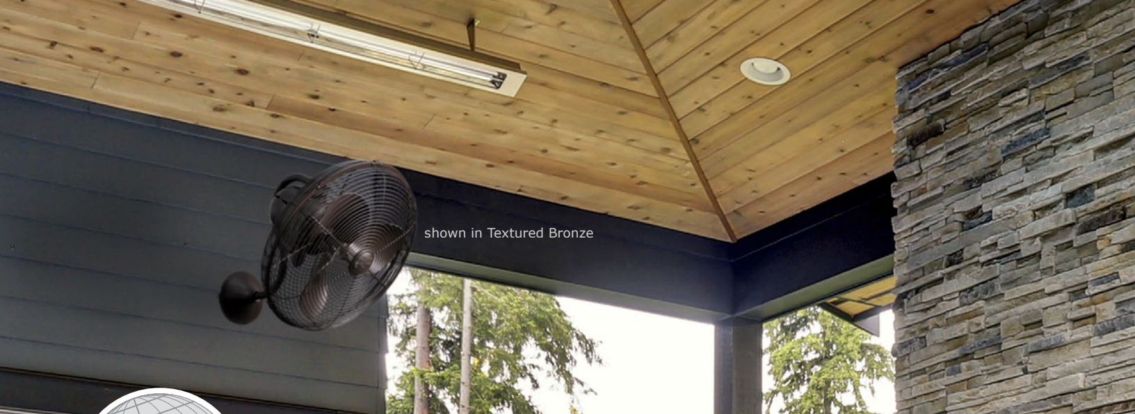
shown in Textured Bronze