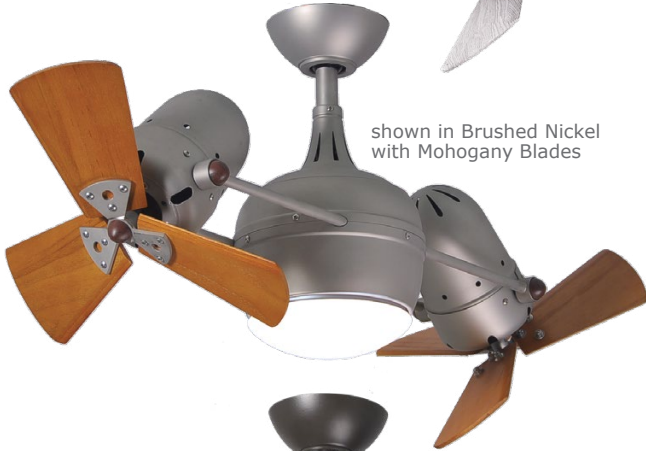
shown in Brushed Nickel with Mahogany Blades