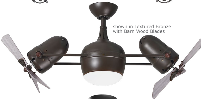
shown in Textured Bronze with Barn Wood Blades