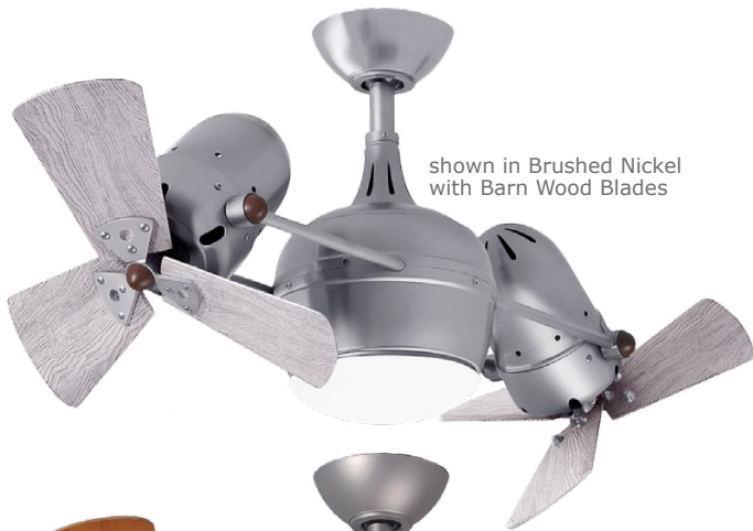
shown in Brushed Nickel with Barn Wood Blades