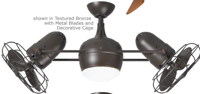
shown in Textured Bronze with Metal Blades and Decorative Cage