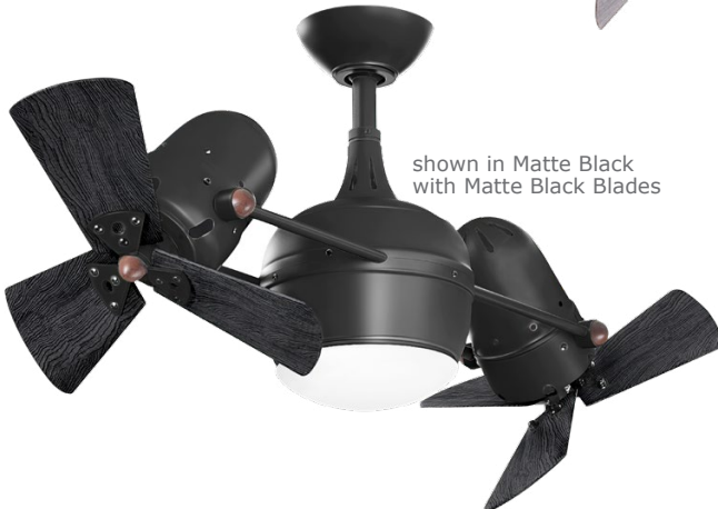
shown in Matte Black with Matte Black Blades