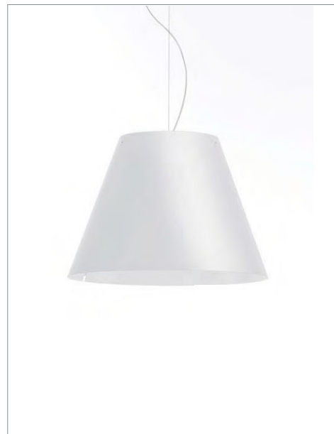
D13G si - D13G sflu