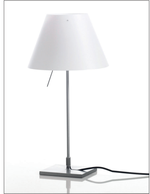
D13 pi. - D13 pi.c.