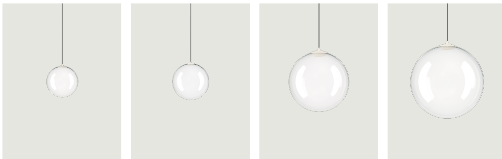
Random Solo 12