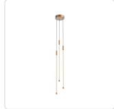
MP75227-BG Brushed Gold