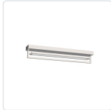
SF16230-BN Brushed Nickel