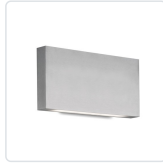
AT67010-BN Brushed Nickel