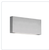
AT6610-BN Brushed Nickel