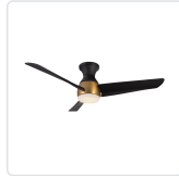
HF91954-BG/MB Brushed Gold/Matte Black