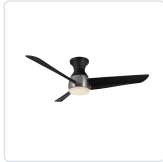
HF91954-BN/MB Brushed Nickel/Matte Black