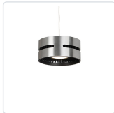
PD6705-BN Brushed Nickel