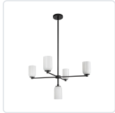
CH57731-BK/GO Black/Glossy Opal Glass