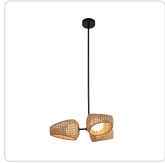
CH20625-BK/OP Black/Opal Matte Glass