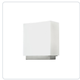
WS3909-BN Brushed Nickel