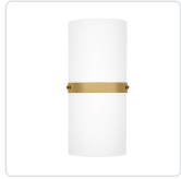
WS3413-BG Brushed Gold