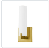
601484BG-LED Brushed Gold