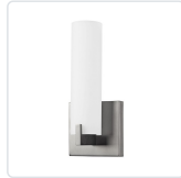
601484BN-LED Brushed Nickel