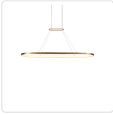
PD19347-AN Antique Brass