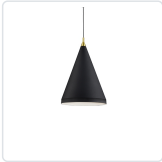
492716-BK/GD Black with Gold detail