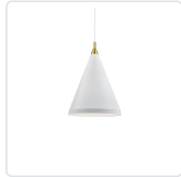
492716-WH/GD White with Gold detail