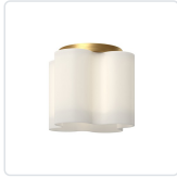
FM54809-BG/OP Brushed Gold/Opal Glass