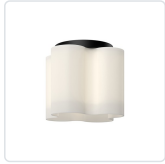
FM54809-BK/OP Black/Opal Glass