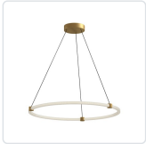
PD24732-BG Brushed Gold