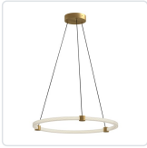
PD24724-BG Brushed Gold