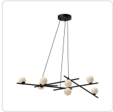
CH89854-BK/GO Black/Glossy Opal Glass