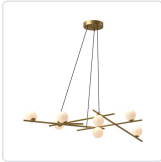
CH89854-BG/GO Brushed Gold/Glossy Opal Glass