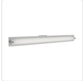
601002BN-LED Brushed Nickel